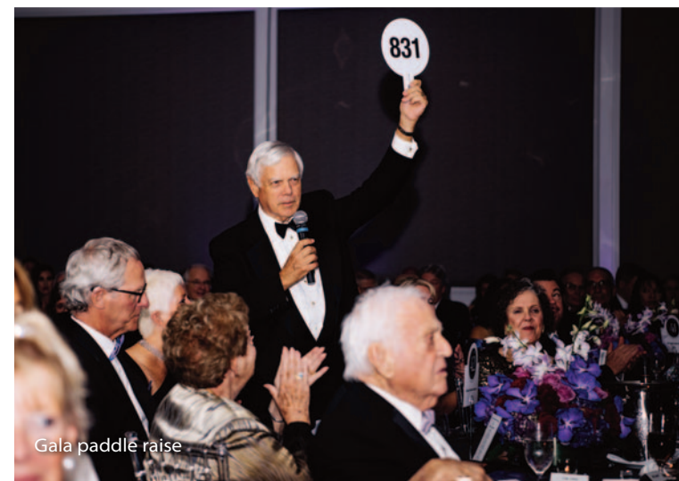
Gala paddle raise